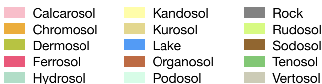
Figure 1: Soils types across Australia